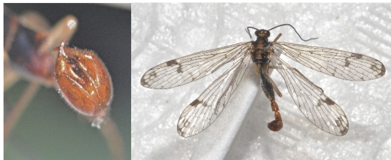
The Scarce Scorpionfly from the Forest of Dean

Showing the reduced wing markings of this species and the male's straight V-shaped calipers