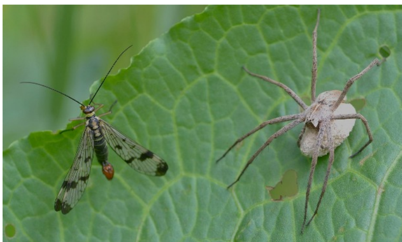
Scorpionfly and spider in a tense stand-off

A harmless mecopterist wandering through Welshbury Wood one day in June 2013 witnessed this confrontation between a male common scorpionfly ( P. communis ) and a spider (believed to be a female Pisaura mirabilis ). Both of the participants were on a large leaf ( dock? - Ed.) among ground vegetation in the main track through the wood.